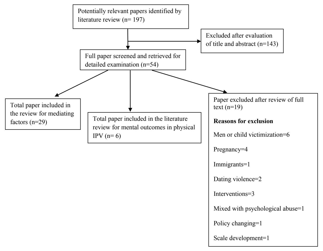
Figure 1: Flowchart of study selection for literature review.